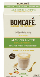
Almond Latte 99% Fat & Sugar Free