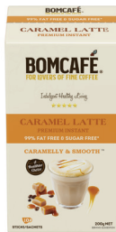
Caramel Latte 99% Fat & Sugar Free