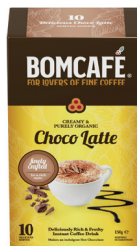
Choco Latte Organic