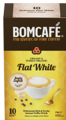
Flat White Organic