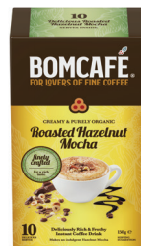
Hazelnut Mocha Organic