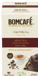
Mocha Dairy Free