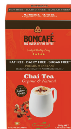
Chai Tea Organic