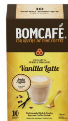
Vanilla Latte Organic