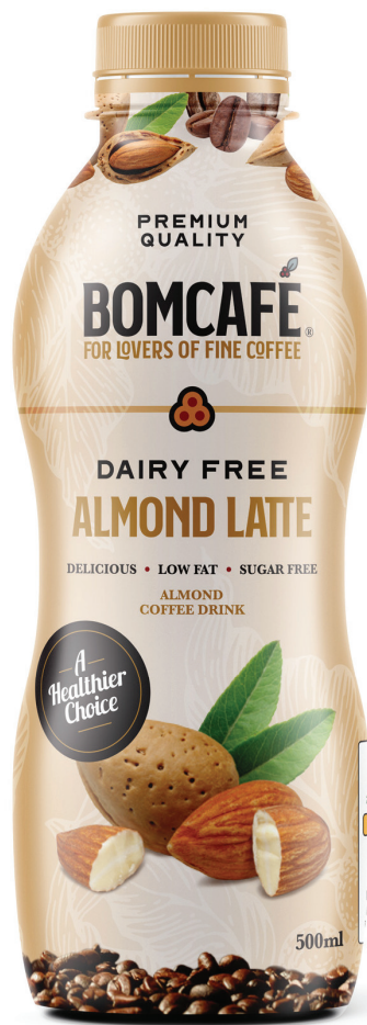
Almond Latte 500mL