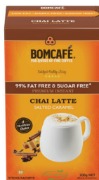
Chai Tea Salted Caramel