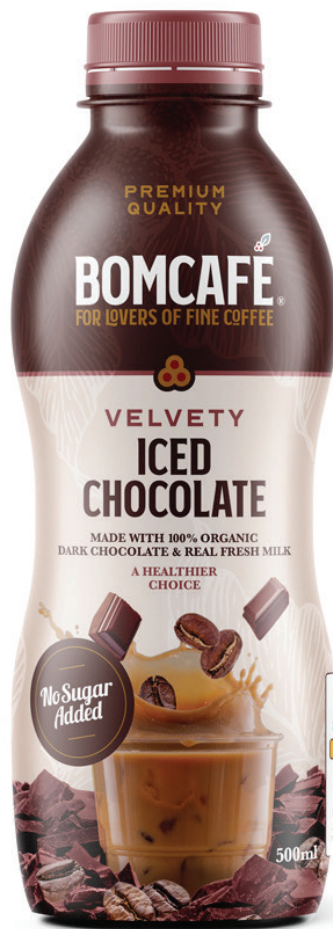
Premium Iced Chocolate 500mL

Low Fat • Dairy Free • Sugar Free* • Gluten Free • Low GI