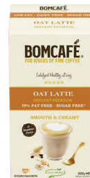
Oat Latte 99% Fat & Sugar Free