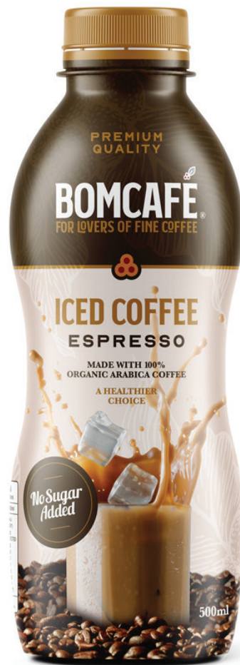
Espresso Iced Coffee