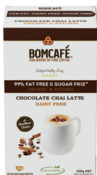
Chocolate Latte Dairy Free