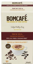
Mocha 99% Fat & Sugar Free