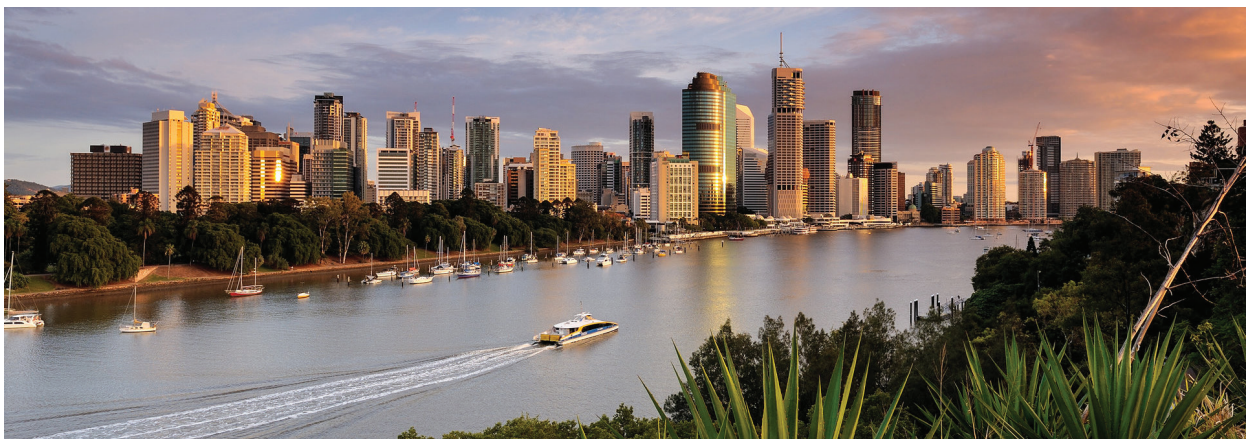
Brisbane City, Australia

Our corporate headquarters is located in Australia, the gateway for fast-growing Asia-Pacific markets, with 4 billion inhabitants accounting for 60% of the world population. The Asia Pacific is the fastest developing coffee market. Factors such as the rising disposable income, rising coffee culture, increase in the number of cafés, and augmented demand for premium cafés are significant drivers for market development.