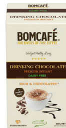
Chocolate Dairy Free