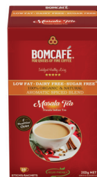
Masala Tea Organic