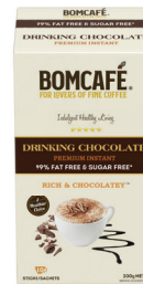
Chocolate 99% Fat & Sugar Free