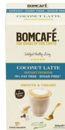
Coconut Latte 99% Fat & Sugar Free