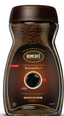
Italian Style (Classic)