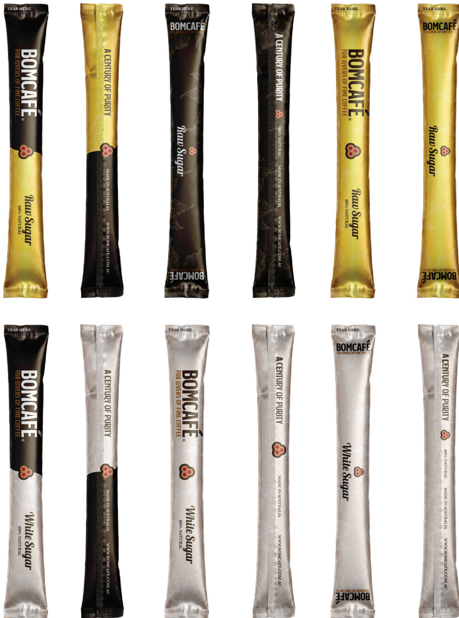
Organic Sugars Sachet 20g