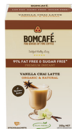
Vanilla Latte Organic