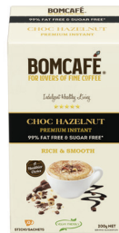
Choc Hazelnut 99% Fat & Sugar Free