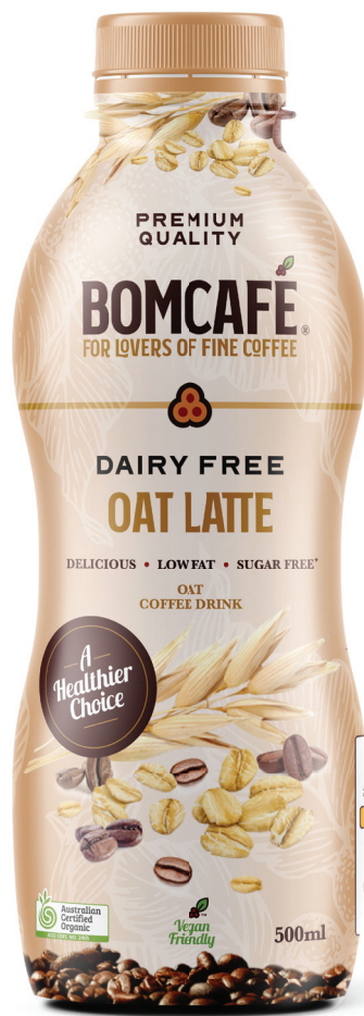
Oat Coffee Drink 500mL