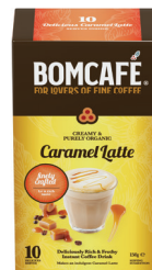
Caramel Latte Organic