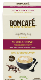
Mochaccino 99% Fat & Sugar Free