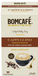
Cappuccino 99% Fat & Sugar Free