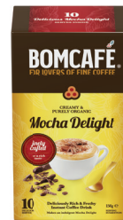
Mocha Delight Organic