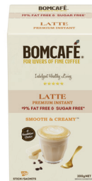
Latte 99% Fat & Sugar Free