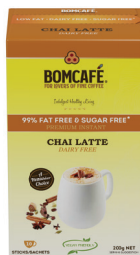
Chai Latte Dairy Free